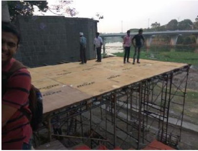
Main stage (Block A)

*Enclosed are the photographs of previous years infrastructure , Bidder needs to consider this as the guideline for the work proposed.