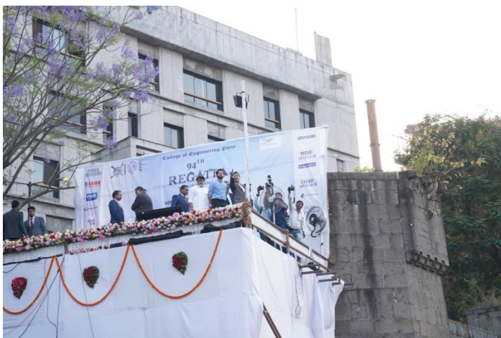
Main stage(Block A)